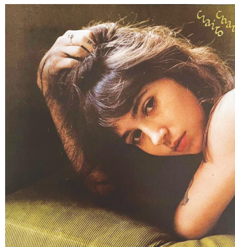
American pop artist Claire's "Charm" album cover

beginning and middle of her career as a musician to show a fully actualized version of the singer-songwriter from