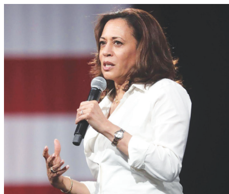
Harris began her campaign by appealing to younger generations.

Social media serves as a powerful platform for Harris to connect with younger