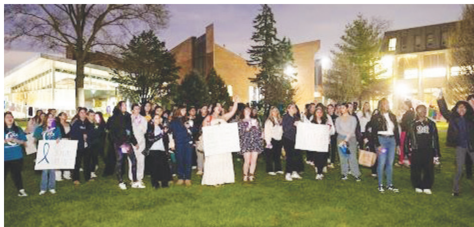
Students gathered on the Flagpole Lawn to make their voices heard.