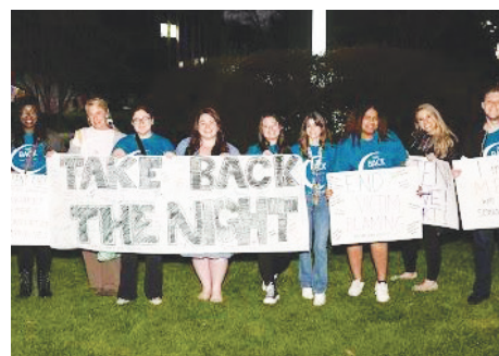
Take Back the Night's annual demonstration to end forms of domestic and sexual violence shows support for survivors.

laboration with Safe Center, a Long Island nonprofit that serves survivors of various forms of violence, including intimate partner violence and sexual assault.