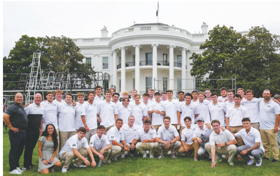
NCAA Division II champion Panthers posed outside the White House in July where Vice President Kamala Harris congratulated the many collegiate athletes from across the country.