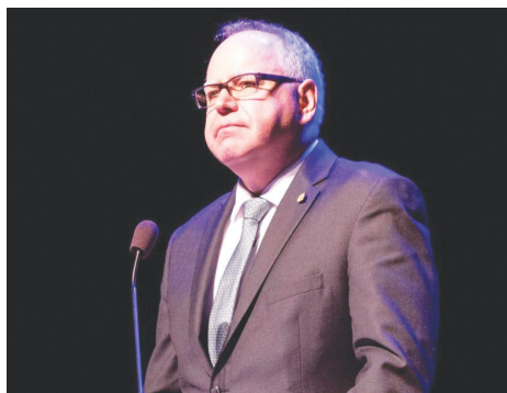
The popular Minnesota Governor brings an inclusive perspective to the Harris-Walz ticket.