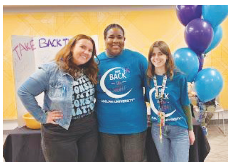
Adelphi's Title IX office is boosting campus awareness on sexual assault and domestic violence through events and outreach.