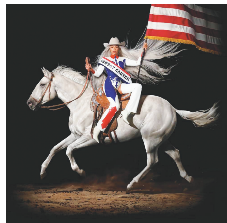
The new album "COWBOY CARTER" from "Queen Bey" has the sounds of the summer.

back in March, it has served as the perfect hype album through plenty of beach drives and lake visits that the summer brought. Beyoncé once again shows why she is the queen of the music industry with her eighth studio album, mixing countless styles. Country music comes to the forefront in an unfamiliar fashion for the already musically diverse artist in hopes of shining light on Black country artists from the years before. Beyoncé intertwines her R&B influences into these country songs and even shows off her rendition of the famed "Jolene" by Dolly Parton, bringing a fresh perspective to the song's narrative. The genre-blending style has caused me to add some country music to my playlists, which had been